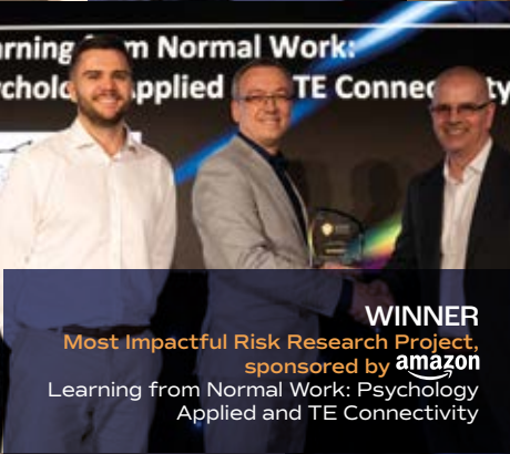
WINNER Most Impactful Risk Research Project, sponsored by amazon Learning from Normal Work: Psychology Applied and TE Connectivity