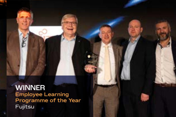
WINNER Employee Learning Programme of the Year Fujitsu