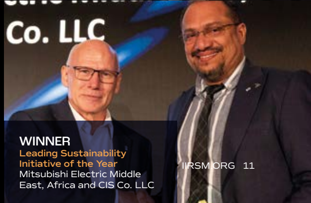
WINNER Leading Sustainability Initiative of the Year Mitsubishi Electric Middle East, Africa and CIS Co. LLC