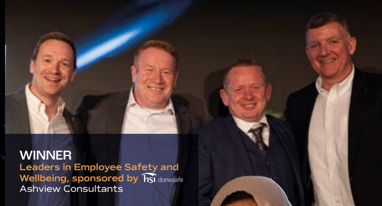
WINNER Leaders in Employee Safety and Wellbeing, sponsored by hsi donesafe Ashview Consultants