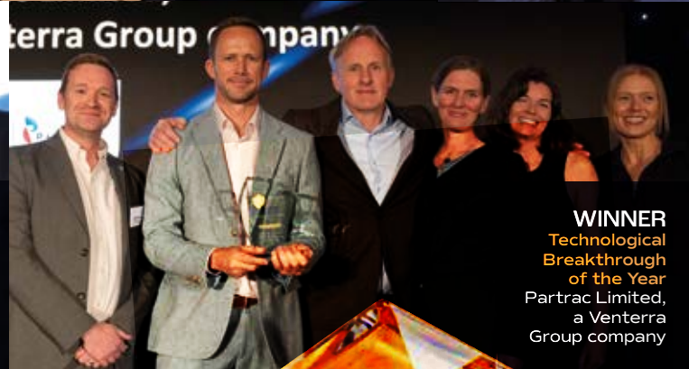
WINNER Technological Breakthrough of the Year Partrac Limited, a Venterra Group company