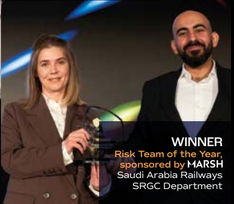
WINNER Risk Team of the Year, sponsored by MARSH Saudi Arabia Railways SRGC Department